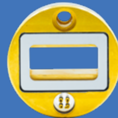
Hermetic Window Assembly Autoclavable hermetically sealed windows.