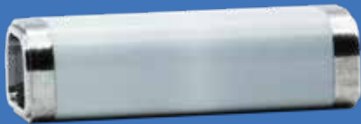
Implantable Ceramic Case Ceramic cases for medical implants and neuro-stimulators.

Specializing in hermetically sealed feedthroughs and windows for medical products.